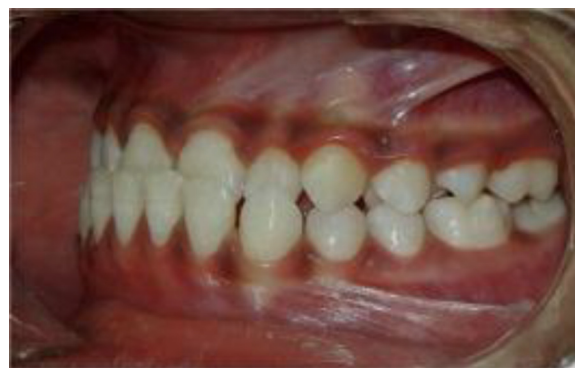
Fig. 1. Angle class III malocclusion (there is a mesial occlusion of the lower arch).

Similar to most of the malocclusions and dentofacial deformities, the etiology of Class III malocclusion is multifactorial. It results from a distortion of normal development, rather than from any pathological process. Expressions of Class III malocclusion are results of interaction between innate factors or genetic hereditary with environmental factors [21–23].